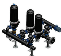
DISC UF 60

The flow and output depends on the raw water quality